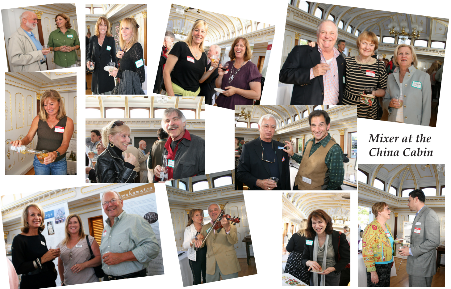
Mixer at the China Cabin