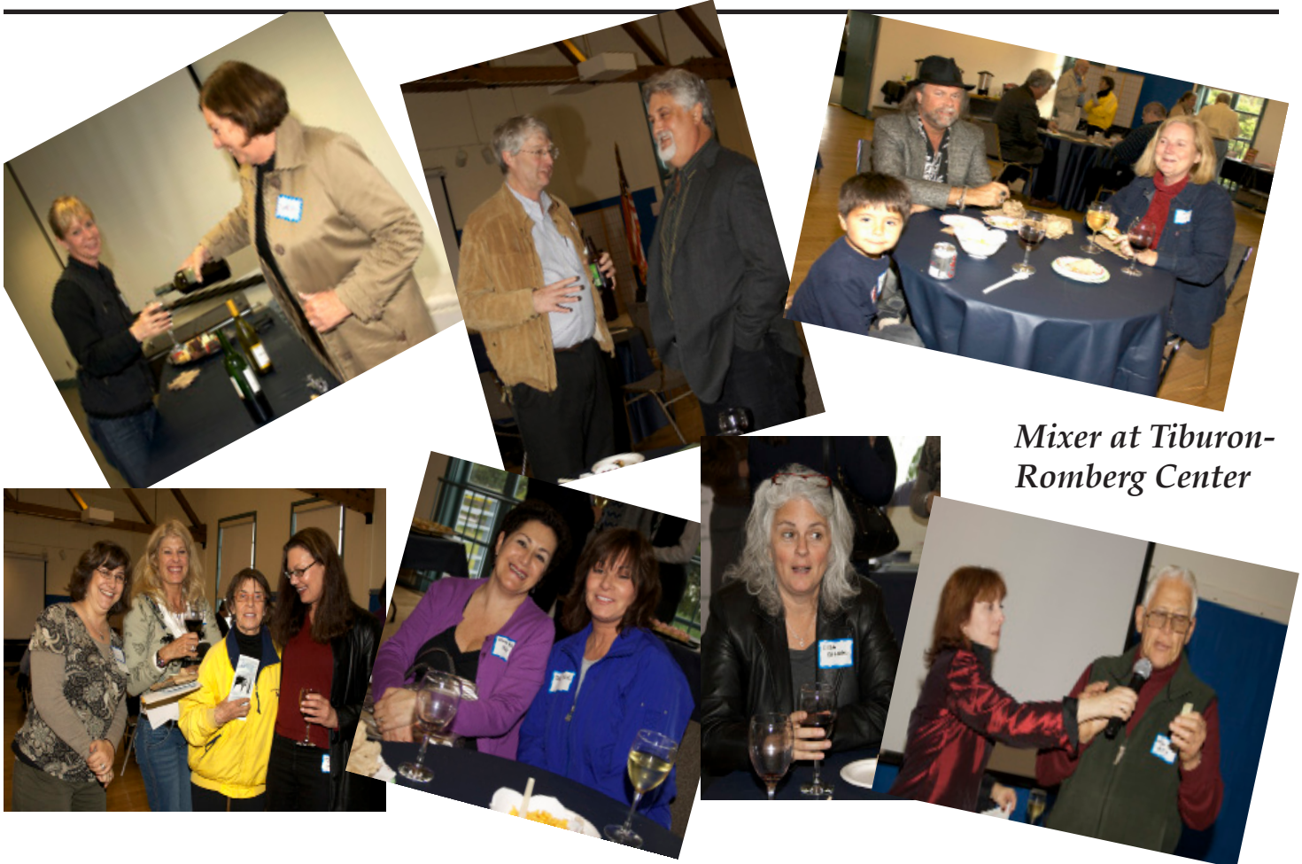
Mixer at Tiburon-Romberg Center

Citrus is open every day, 11 a.m. to 6 p.m. It also will be open during Friday Nights on Main until 8 p.m. Citrus is at 13 Main Street. Phone, 435-1321. Check out its new Website at: www.shopcitrus.com .